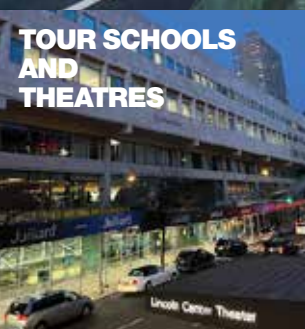
TOUR SCHOOLS AND THEATRES