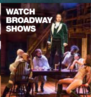
WATCH BROADWAY SHOWS